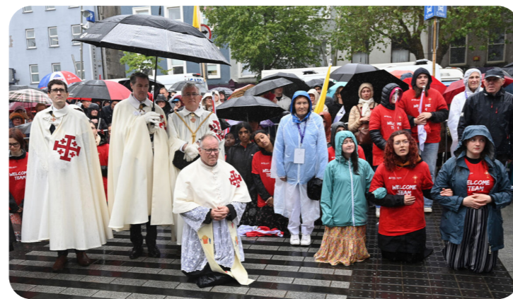
7th June 2026.... Kneeling in prayer during the wet weather at the centenary year Eucharistic procession in Cork.

Tablet. (1) Pope Leo's Augustinian vision -- In his encyclical protecting the dignity of the human person in the era of AI, Pope Leo knits the insights of Augustine's City of God into Catholic Social Teaching. (2). Israel, faith and politics -- The battle for the soul of Judaism. (3). Pope asks Mary to help bring peace. (4). Spain -- Secularists oppose Pope addressing legislature.