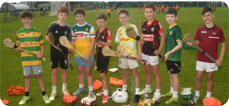
Boys and Girls enjoying the Rockies Kellogs Cul Camp at Church Road.