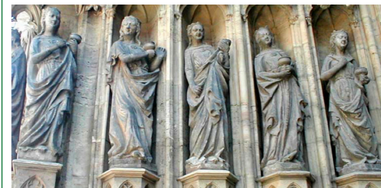
The 5 Wise Bridesmaids (Erfurt Cathedral)