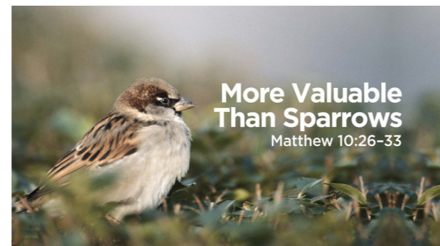
More Valuable Than Sparrows Matthew 10:26-33