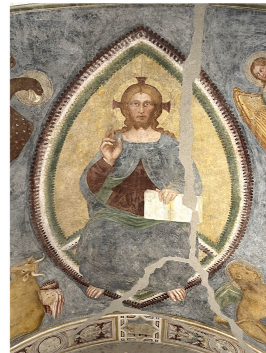
Christ enthroned Brera Gallery Milan

The story is also strange... it is strange, when you think about, to have the story of a judicial execution at the centre of our faith. Paradoxically, in these days we celebrate the great events which gave us new life in Christ. It does give rise to thought.