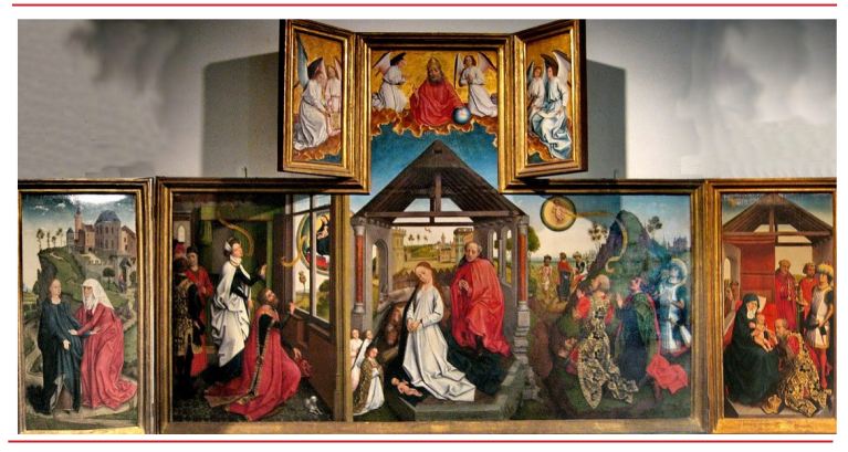
Church collection on Christmas Eve and Christmas Day is for the Priests of the parish.

Catholic Voice. (1). Christmas Meditation on the Sacred infancy of Jesus. (2) Islam in Qatar vs Islam in Europe -- The mainstream narrative is full of glaring double standards (3). Pope Francis talks about church division, women priests, abortion and China.