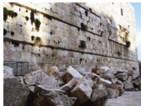
Part of the Temple in Jerusalem today

Lo, I will send you the prophet Elijah before the great and terrible day of the Lord comes. He will turn the hearts of parents to their children and the hearts of children to their parents, so that I will not come and strike the land with a curse. (Malachi 4:5-6 NRSV)