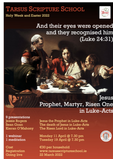
Tarsus Scripture School Programme for Lent and Easter 2022