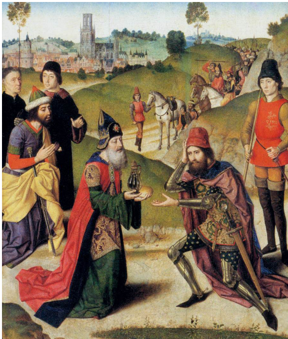
Meeting of Abraham and Melchizedek

Pandemic Guidelines Following Tuesday's government statement on Covid-19 public health measures, public worship can take place without capacity limits from 22nd October but with all protective measures remaining in place. These remaining protective measures include : ● Mask wearing ● Good ventilation ● Sanitisation on entry and departure ● Social distancing insofar as possible We are very grateful to volunteer stewards, those who sanitise and clean churches and church personnel who continue to maintain churches so that we can gather safely and joyfully for public worship. November is always a special time in our churches when people and families gather to remember their loved ones who have died and greater numbers will gather for remembrance Masses. In light of this we need to continue to be vigilant in relation to protective measures working closely with our parish volunteers and stewards to make sure that everything is in order. Let us continue to keep each other in prayer. Yours sincerely in Christ + Fintan Gavin Bishop of Cork and Ross