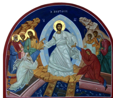
Alleluia Christ is Risen - He is truly Risen!

Spring is the time of year that we celebrate Easter and the Resurrection of Jesus. We look forward to the bright spring days and celebrating the message of Easter of hope and new life.