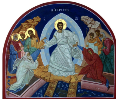
Allotual Christ is Risen - He is truly Risen!

Spring is the time of year that we celebrate Easter and the Resurrection of Jesus. We look forward to the bright spring days and celebrating the message of Easter of hope and new life.