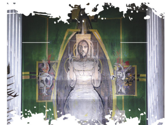
From Coventry Cathedral

God of life, source of all faith, through the waters of baptism you have raised us up in Christ and given us life that endures. Day by day, refine our faith that we who have not seen the Christ, may truly confess him as our Lord and God, and share the blessedness of those who believe. Through Christ our Lord. Amen.