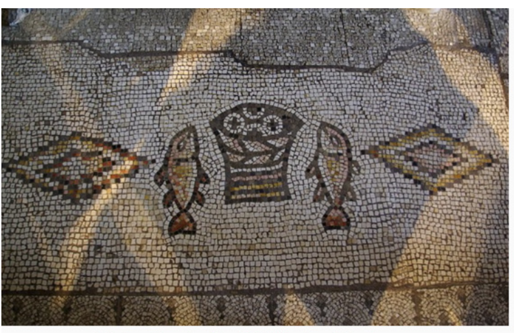
Taboha: Church of the Multiplication of the Loaves

Universe/Catholic Times: Journey in Faith -- Where to now? The post-contagion Church. (2) Papal Nuncio backs plans tor to rebury babies found in Tuam mass grave. (3) Vatican Letter -- Saintly caution: Church's reputation on the line when judging sanctity.