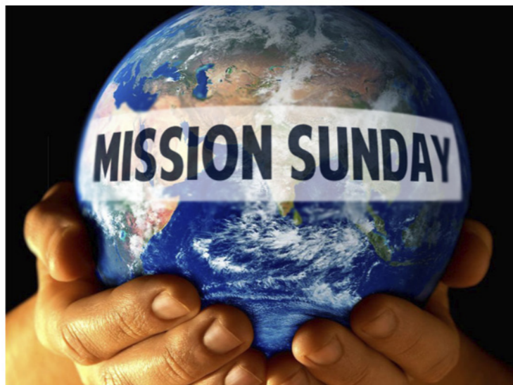
Go out to the whole world and proclaim the Good News!