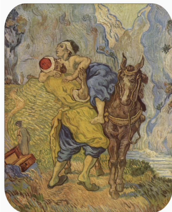
Vincent van Gogh, The Good Samaritan (after Eugène Delacroix), 1890. Oil on canvas, the Kröller-Müller Museum, Otterlo, The Netherlands.

BLACKROCK VINCENT DE PAUL The July collection for SVP will be on weekend 13th & 14th July.